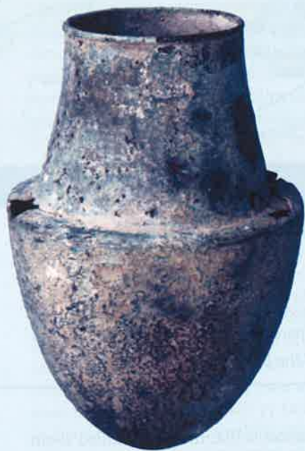
From ancient times to the nineteenth century, physicians often used cups such as this (above) to aid in bloodletting. The cup was heated to create a vacuum and then placed on the skin, where it would draw blood to the surface before a vein was cut. (cup: © Trustees of the British Museum/Art Resource, NY; doctor: From Tractatus de Pestilencia , by M. Albik/Private Collection/Archives Charmet/Bridgeman Images)

smelling herbs or other substances, like rosemary, juniper, or sulfur, in front of the nose. Treatment concentrated on ridding the body of poisons and bringing the fluids into balance. As one fifteenth-century treatise put it, “everyone over seven should be made to vomit daily” and twice a week wrap up in sheets to “sweat copiously.” The best way to regain health, however, was to let blood: “as soon as [the patient] feels an itch or pricking in his flesh [the physician] must use a goblet or cupping horn to let blood and draw down the blood from his heart, and this should be done two or three times at intervals of one or two days at the most.” Letting blood was considered the most effective way to rebalance the fluids and to flush the body of poisons.