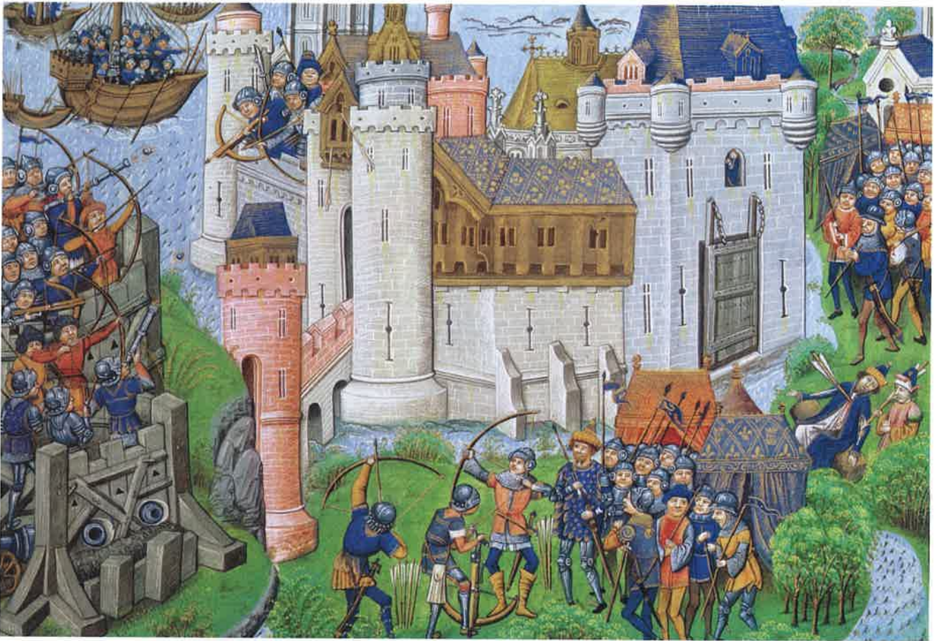
Siege of the Castle of Mortagne Medieval warfare usually consisted of small skirmishes and attacks on castles. This miniature shows the 1377 French siege of an English-held castle near Bordeaux that held out for six months. Most of the soldiers use longbows, although at the left two men shoot primitive muskets above a pair of cannon. Painted in the late fifteenth century, the scene reflects the military technology available at the time it was painted, not at the time of the actual siege.

expelled from France. Joan traveled to the French court wearing male clothing. She had an audience with Charles, who had her questioned about her angelic visions and examined to make sure she was the virgin she said she was. She secured his support to travel with the French army to Orléans dressed as a knight—with borrowed armor and sword. There she dictated a letter to the English ordering them to surrender: