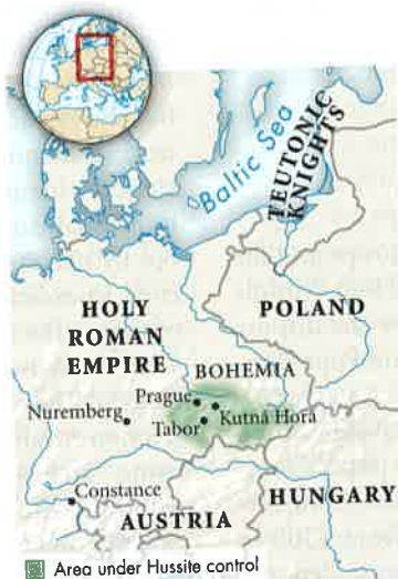
The Hussite Revolution, 1415–1436

The English scholar and theologian John Wyclif (WĪH-klihƒ) (ca. 1330–1384) went further than the conciliarists in his argument against medieval church structure. He wrote that the Scriptures alone should be the standard of Christian belief and practice and that papal claims of secular power had no foundation in the Scriptures. He urged that the church be stripped of its property. He also wanted Christians to read the Bible for themselves and produced the first complete translation of the Bible into English. Wyclif’s followers, dubbed Lollards, from a Dutch word for “mumble,” by those who ridiculed them, spread his ideas and made many copies of his Bible. Lollard teaching allowed women to preach, and women played a significant role in the movement. Lollards were persecuted in the fifteenth century; some were executed, some recanted, and others continued to meet secretly in houses, barns, and fields to read and discuss the Bible and other religious texts in English. Bohemian students returning from study at the University of Oxford around 1400 brought Wyclif’s ideas with them to Prague, the capital