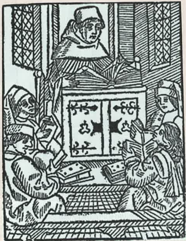
A sixteenth-century woodcut of Meister Eckhart teaching.

Eckhart’s unusual teachings led to charges of heresy in 1327, which he denied. The pope—who was at this point in Avignon—presided over a trial condemning him, but Eckhart appears to have died during the course of the proceedings or shortly thereafter. His writings were ordered destroyed, but his followers preserved many and spread his teachings.