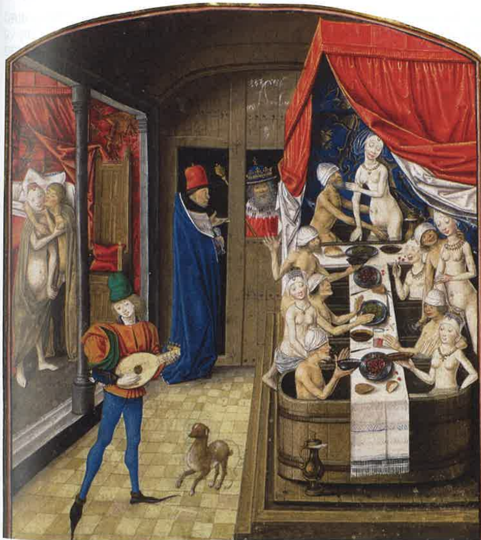
Public Bath In this fanciful scene of a medieval public bath from a 1470 illuminated manuscript, men and women soak in tubs while they eat and drink, entertained by a musician, and a king and church official look on. At the left is a couple about to hop in a bed for sex in what might be a brothel. Normal public baths were far less elaborate, and while they did sometimes offer food, wine, and sex, their main attraction was hot water. This painting is not meant to be realistic but a commentary on declining morals. (Miniature from a manuscript, Factorum et dictorum memorabilium , by Valerius Maximus for Antoine of Burgundy, ca. 1470)

Along with buying sex, young men also took it by force. Unmarried women often found it difficult to avoid sexual contact. Many worked as domestic servants, where their employers or employers' sons or male relatives could easily coerce them, or they worked in proximity to men. Notions of female honor kept upper-class women secluded in their homes, particularly in