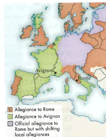
The Great Schism, 1378–1417

Urban VI (pontificate 1378–1389) had excellent intentions for church reform, but he went about it in a tactless manner. He attacked clerical luxury, denouncing individual cardinals and bishops by name, and even threatened to excommunicate some of them. The cardinals slipped away from Rome and met at Anagni. They declared Urban's election invalid because it had come about under threats from the Roman mob, and excommunicated the pope. The cardinals then elected