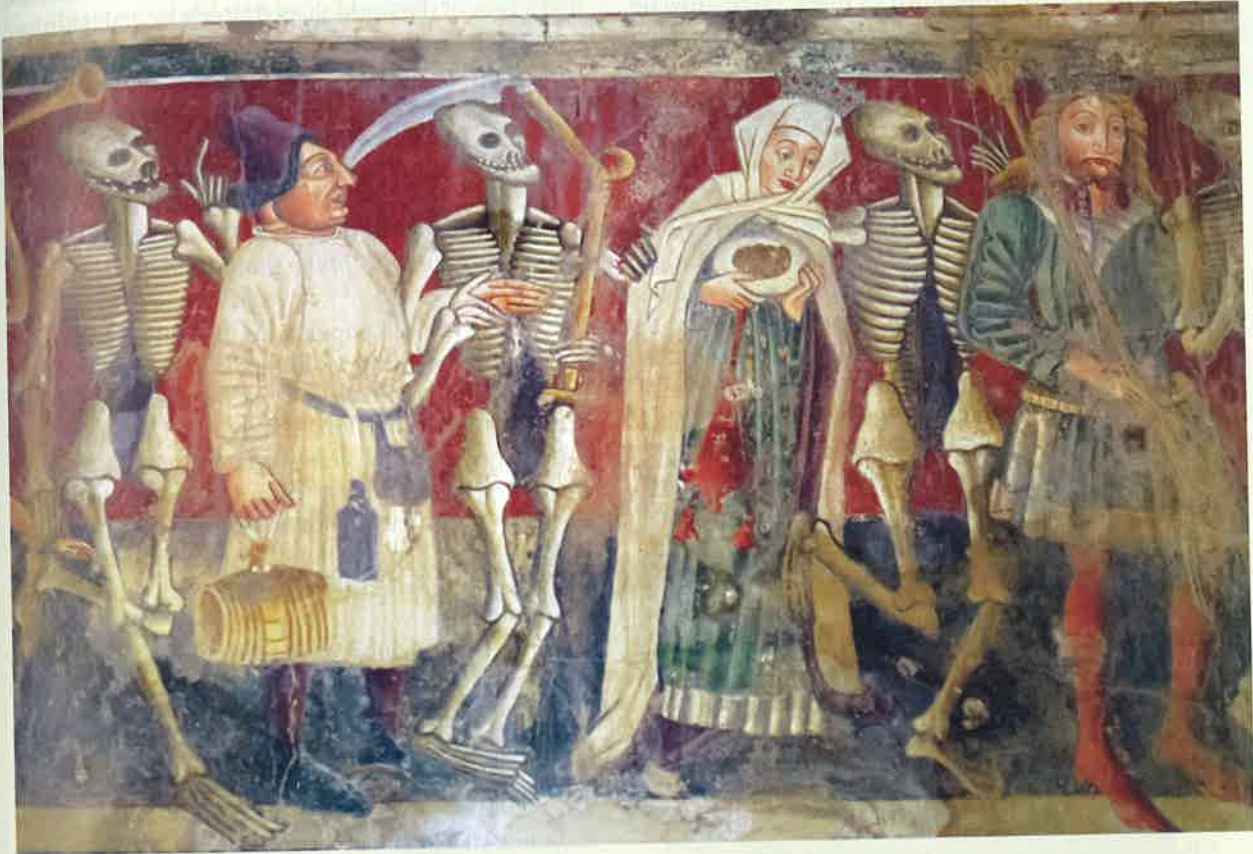
(Fresco, 1475, Chapel of Our Lady of the Rocks, Croatia)

In this fifteenth-century fresco from a tiny church in Croatia, skeletons lead people from all social classes in a procession.