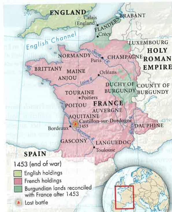
MAP 11.2 The Hundred Years' War, 1337-1453 These maps show the change in the land held by the English and French crowns over the course of the Hundred Years' War. Which year marked the greatest extent of English holdings in France?